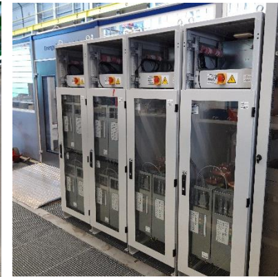
HL-LHC EE systems