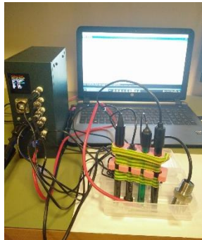
Final Year Project: Designing and testing "electronic tongue" for characterisation of wine