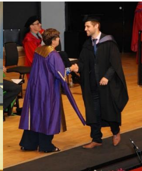
University of Warwick: MEng Electronic Engineering