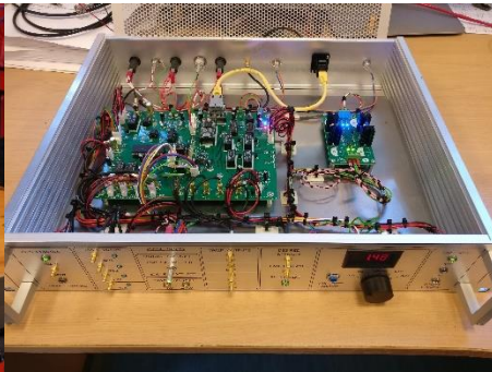
ISIS Pulsed Neutron and Muon Source: Beam Diagnostics Operations Graduate Electronics Engineer